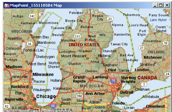
Sample Map-In-A-Box Map (Terrain map)